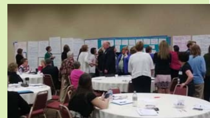
Above: A photo from the previous community input session.