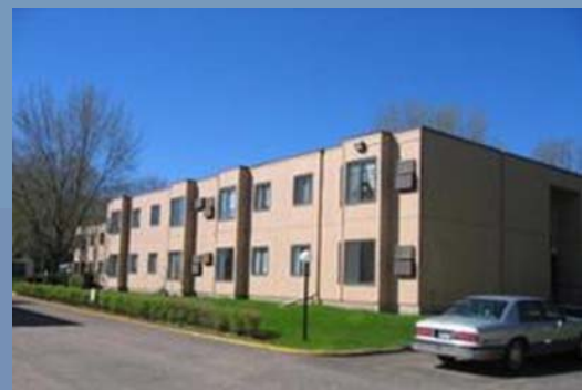
Below: A photo of Sibley Estates West, located in Winthrop.