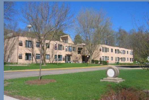
Above: A photo of Sibley Estates East, located in Henderson.

Meeker-McLeod-Sibley SHIP continues to assist additional multiunit housing properties in going smoke-free.